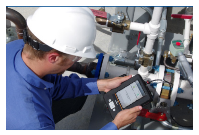
With the Trex communicator, you can do more in the field than ever before.