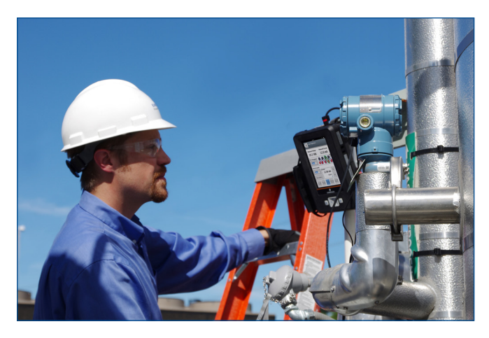
The magnetic hanger accessory allows you to attach the Trex unit to a pipe, freeing up your hands for other work.

You can also verify whether the DC voltage is correct in HART loops.