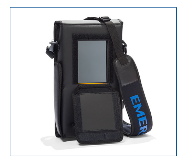
The useful carrying case protects your Trex unit in the field and provides storage options for accessory items.

Using the ValveLink Mobile app on the Trex unit, you can perform valve diagnostics in the field, including valve signature, dynamic error band, PD one button sweep, and step response, without having to pull the valve or perform invasive troubleshooting steps. ValveLink Mobile works with HART and Foundation Fieldbus Fisher® FIELDVUE™ digital valve controllers and provides an intuitive user interface that is easy to understand and use. The large touchscreen on the Trex communicator makes it easier than ever to see all valve diagnostic details.